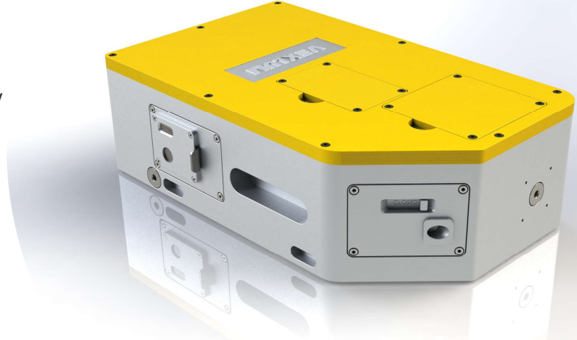
Vertical-external-cavity surface-emitting laser (VECSEL) a.k.a. Optically pumped semiconductor laser (OPSL)